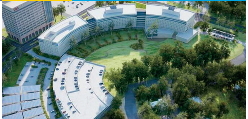
GSA conducted a major energy-efficiency upgrade at the New Carrollton Federal Building in Lanham, Maryland, which included an extensive lighting retrofit that yielded a 82% reduction in energy use and earned GSA two awards from the U.S. Department of Energy Interior Lighting Campaign

GSA hired Amaresco, Inc., an energy service company, to conduct the upgrades, which included replacing 12,100 fluorescent troffer fixtures with 11,800 LED fixtures by Eaton Cooper Lighting. Amaresco used a mock-up process to identify the best lighting option and the Eaton Cooper fixtures were chosen for their long life (rated at 50,000 hours), 10-year warranty, low glare, high efficacy, and ease of installation.